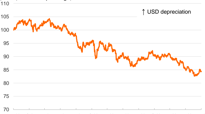
Nov-20 Feb-21 May-21 Aug-21 Nov-21 Feb-22 May-22 Aug-22 Nov-22 Feb-23 May-23 Aug-23 Nov-23