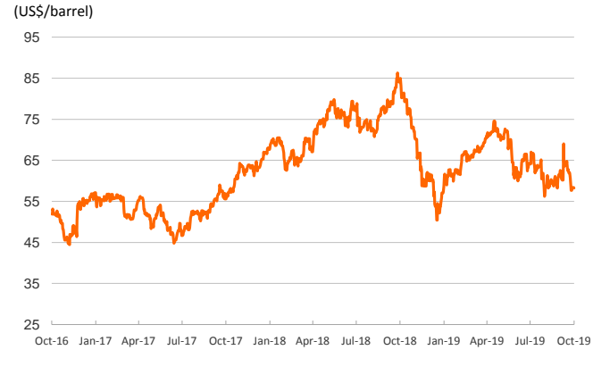
Brent oil price

1.00 ______ 0.82 Oct-16 Jan-17 Apr-17 Jul-17 Oct-17 Jan-18 Apr-18 Jul-18 Oct-18 Jan-19 Apr-19 Jul-19 Oct-19