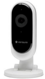
Offer | Cloudcam Pro