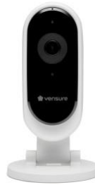
Offer | Cloudcam Camera Pro