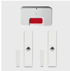
Offer | Anti-attack button and Magnetic Detectors - Shock Sensor