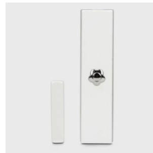
Magnetic Detector - Shock Sensor